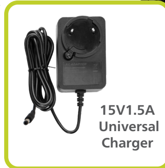
15V1.5A Universal Charger