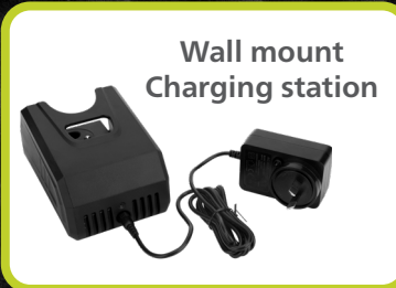
Wall mount Charging station