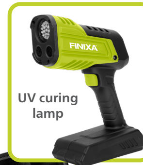
UV curing lamp