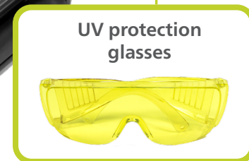
UV protection glasses